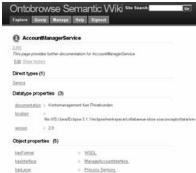
Figure 2: An individual object in Ontobrowse

Ontobrowse addresses key issues in the documentation and maintenance of software architectures. Previously, the different views of an architectural instance were maintained in separate information spaces. The semantic wiki enables the integration of both business-oriented and technical knowledge, thus serving as a single point of information for all stakeholders. Due to the underlying formal representation based on ontologies, searching and querying can be significantly improved. At the same time, the plugin infrastructure makes it possible to integrate knowledge from external sources. Architectural descriptions such as service specifications in two different formats can be mapped to the same ontology. Finally, the conceptual structure is modular so that additional ontologies can be added at any time, e.g. to describe the organizational structure. These extension features are particularly important in distributed development settings (cf. [Cock96]), where the participants have to share their knowledge with other developers.