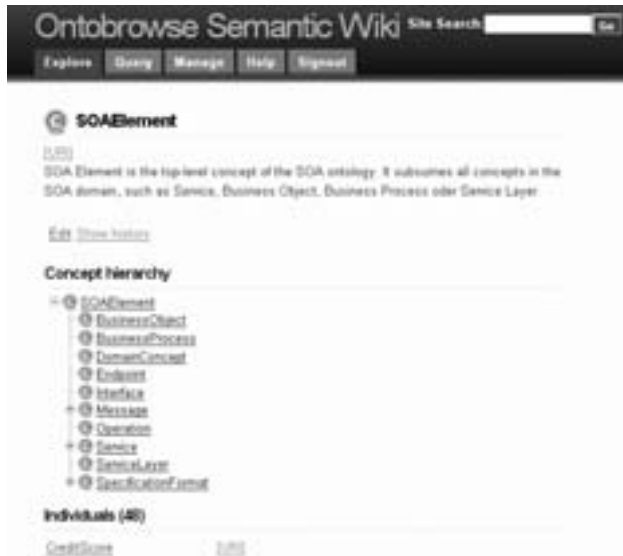
Figure 1: A generic concept in Ontobrowse

In order to integrate architectural descriptions of a SOA into the wiki, one has to perform two distinct steps: First, the users of the wiki need to agree upon a unifying SOA ontology . The ontology defines the terminology of the architecture together with relations and constraints. The terminology can usually be displayed as a concept hierarchy, with a generic concept such as “SOAElement” subsuming more specific concepts such as “Service” and “BusinessObject” (see Figure 1).