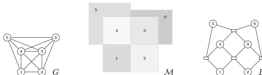
■ Figure 1 A map graph G , a map \mathcal{M} , and a witness B of G .

half-square of some bipartite graph, it turns out that map graphs are exactly half-squares of planar bipartite graphs [5, 6]. If G = (V, E_G) is a map graph and B = (V, W, E_B) is a planar representation of G , then B is called a witness of G . See Figure 1 for an example.