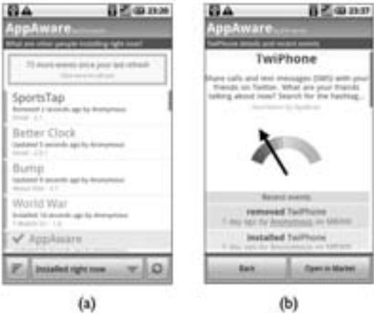
Figure 1. Real-time stream of installed, updated and removed applications (a) and an application's page with its average implicit rating represented by a meter (b).

For each Android application a web page shows its description, the list of recent users' events (installations, updates or removals) and a meter representing its acceptance by the AppAware community (Figure 1b). The core idea behind this meter is that it takes installations, updates and removals of applications as input for the computation. When the gauge points toward the green range the acceptance is excellent, yellow range for good acceptance and red range if almost no AppAware user is keeping the application installed. This continuous stream of application events (installations/removals/updates, see Figure 1a) provides the basis for serendipity for other users [GM10].